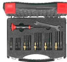
Art. No. 426 017