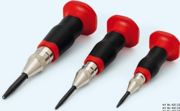
Art. No. 430 231 Art. No. 430 230 Art. No. 430 229

Ergonomic centre-punching with adjustable hand force