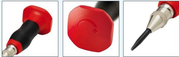
2-component-handguard Adjustable striking force Replaceable, hardened pin