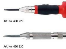
Art. No. 430 130